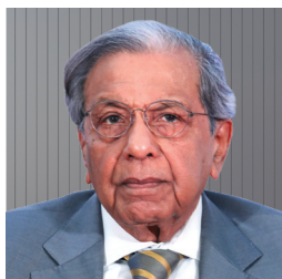
Mr N K Singh Chairman Fifteenth Finance Commission